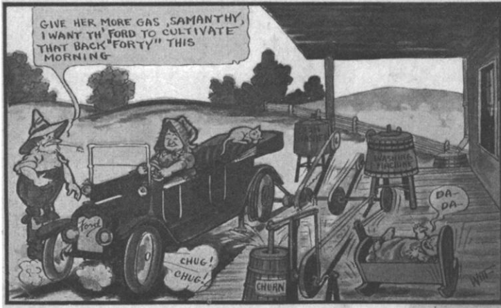
FIG. 3.—Postcard showing alternative uses of the Model T on the farm.

Several accessory manufacturers took advantage of the car's interpretative flexibility and began to commercialize it. Although firms brought out kits to convert the car into a stationary source of power as early as 1912, advertisements for these kits—and others to convert the car into a tractor—did not appear in large numbers until 1917, during wartime shortages of farm labor and horses. Some companies simply sold a pulley to be attached to a jacked-up wheel, but most kit manufacturers realized that jacking up one wheel put an undue strain on the differential gear as one wheel is turning while the other is stationary on the ground. 61 Most kits, therefore, were designed to overcome the problem with the differential. Scientific American described a kit in 1917 that avoided wearing out the differential gear by jacking up both sides of the car and taking power directly from the axle. The Lawrence Auto Power Company in St. Paul, Minnesota, advertised a $35 kit that would take power directly from the crankshaft in the front of a car without having to jack up the car. The company claimed that the device—consisting of a tie-rod, two pulleys, and a metal stand—could operate a feed grinder, corn sheller, silo filler, wood saw, and cream separator. From 1917 to 1919 many